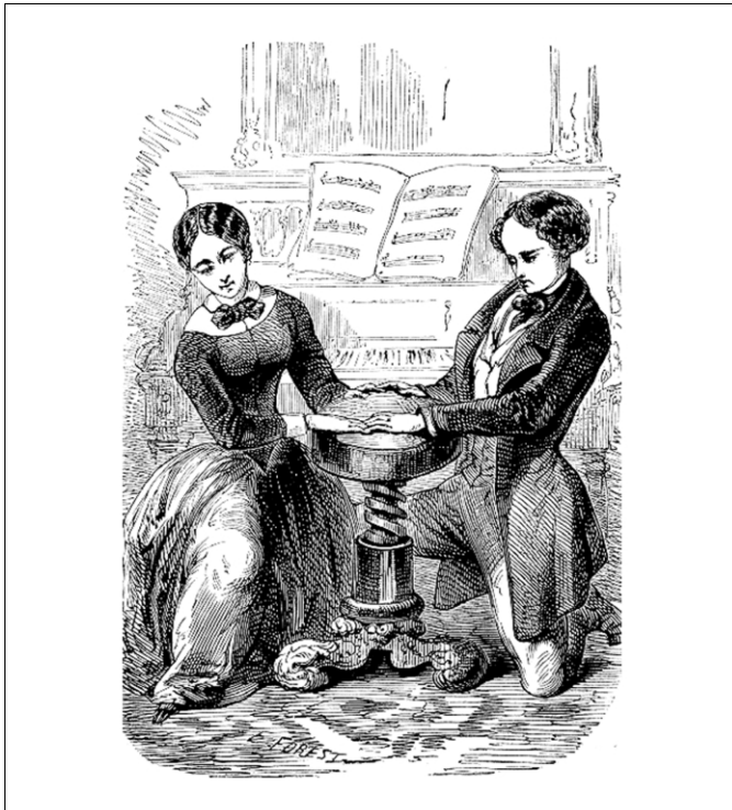
Fig. 2. Parisians in 1853 test the automatic (i.e. unwilling) turning of a piano stool. This kind of practice was part of the Spiritualist fad in the 19th century. Reproduced from Ref. [21].

of the processes whereby action is produced, what is it? The likely sources of the experience of conscious will are the topic of the ‘theory of apparent mental causation’ [19,22].