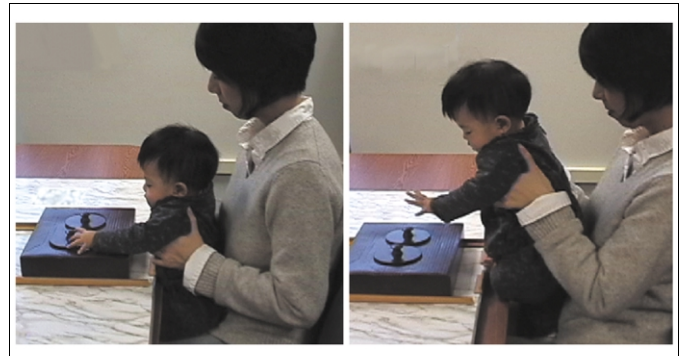
Fig. 3. An infant sitting for an A trial (left) and standing for a B trial (right). This change in posture causes younger infants to search as 12-month-old infants do (see text for details).

shifting the posture of the infant [24]. An infant who sat during the A trials would then be stood up, as shown in Fig. 3, to watch the hiding event at B, during the delay and during the search. This posture shift causes even 8- and 10-month-old infants to search correctly, just like 12-month-olds. In another experiment, we changed the similarity of reaches on A and B trials by putting on and taking off wrist weights [25]. Infants who reached with 'heavy' arms on A trials but 'light' ones on B trials (and vice versa) did not make the error, again performing as if they were 2–3 months older. These results suggest that the relevant memories are in the language of the body and close to the sensory surface. In addition, they underscore the highly decentralized nature of error: the relevant causes include the covers on the table, the hiding event, the delay, the past activity of the infant and the feel of the body of the infant.