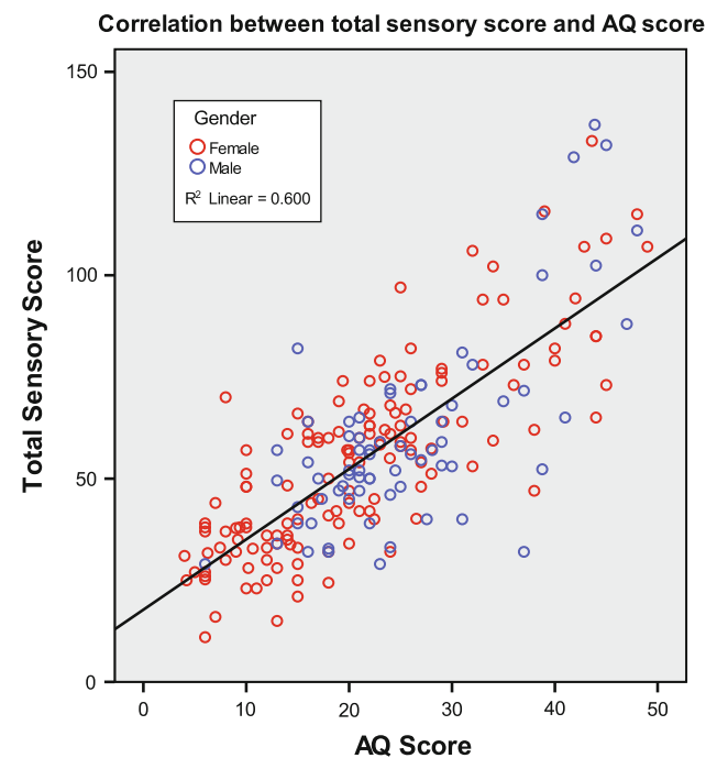
Fig. 1 Correlation between total sensory score (measured by the Sensory Questionnaire) and AQ score (measured by the Autism Spectrum Quotient; Baron-Cohen et al. 2001). Pearson correlation was positive ( r = .775 )